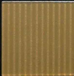
GOLD DUST Metallic