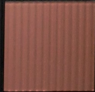
COPPER FIRE Metallic